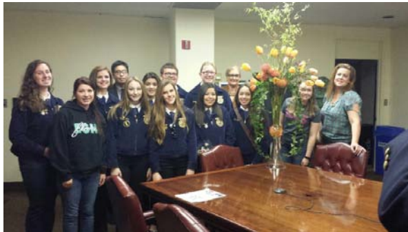
CSFA Board Members and FFA Volunteers Meeting in Governor's Office on Ag Day.