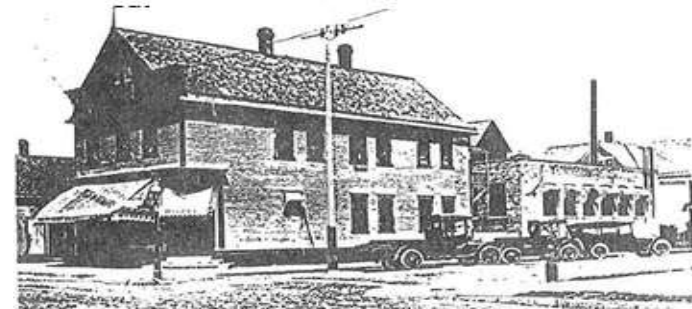
The Quality Sausage Company - 12th & Burleigh; 1920s