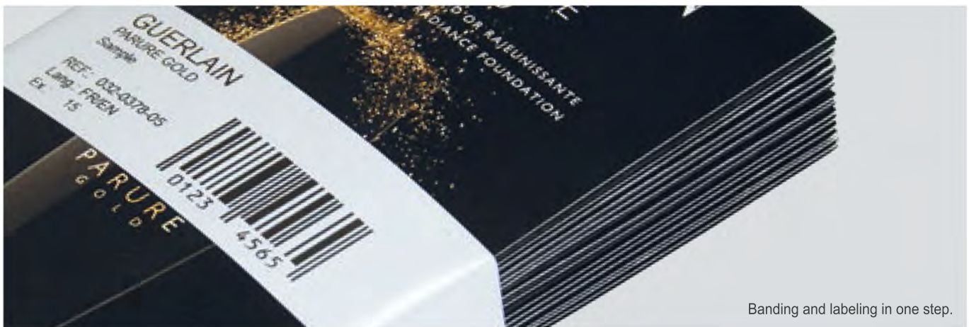
Banding and labeling in one step.