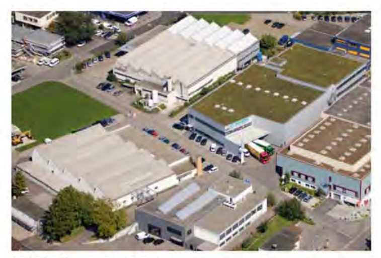
Production / Showroom Meisterschwanden

ATS-Tanner France S.à.r.l. Technopôle d'Archamps, Bâtiment Actipro FR-74160 Archamps Phone +33 4 50 941221 Fax +33 4 50 876125 www.ats-tanner.fr, info@ats-tanner.fr